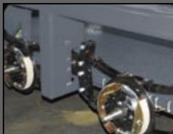
Quadra Spring Suspension For smoother transport.