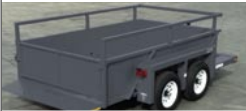
Extended Side Rails Bolted to existing rails for 36 in. or 48 in. heights.