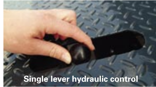
Single lever hydraulic control

hydraulic mechanism used to lower the entire deck of the trailer to ground level. This eliminates the need to drive, pull, winch, or push a payload up or down a loading ramp and provides for faster, safer and more efficient loading of everything from construction and industrial equipment to vending machines and supplies.