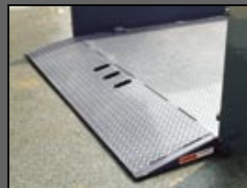
Low Angle Ramp For low clearance loading.