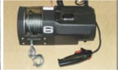
Winch 12-volt loading winch with 12-foot remote control.