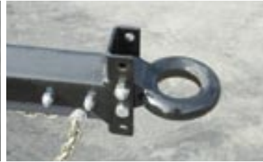
Pintle Hitch Interchanges and replaces standard ball coupler.