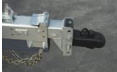
Surge Brakes Heavy-duty actuator with adjustable coupler.