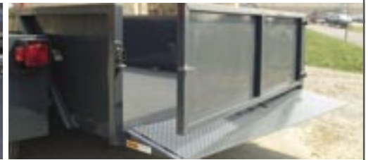
Tailgate Full width swinging tailgate can easily be removed.