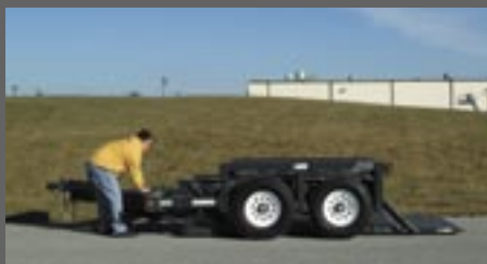
Lower entire deck to ground level