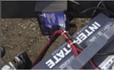
Trickle Charger 1.5-amp on-board charger with indicator lights.