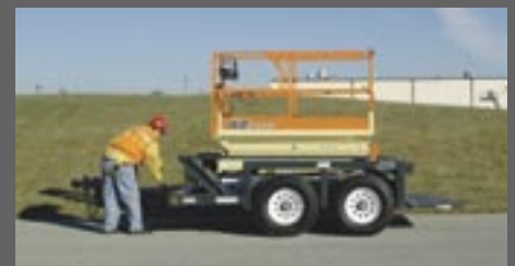
Lift to transport position