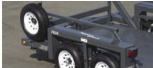
Spare Tire & Bracket Mounts conveniently within the width of the chassis.