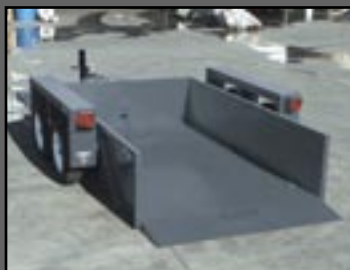
Large Deck Up to 72 inches wide to hold more payload.